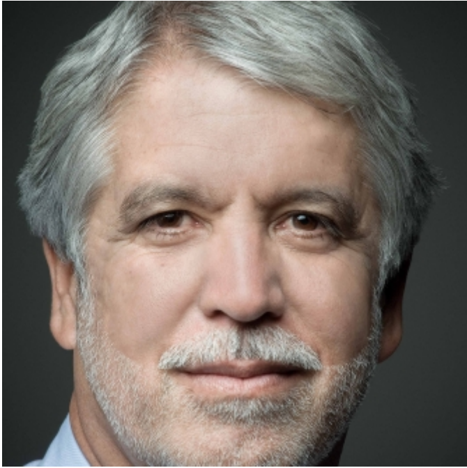
Enrique Peñalosa Londoño Mayor of Bogotá