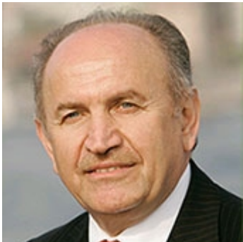
Kadir Topbaş President of UCLG, Mayor of Istanbul