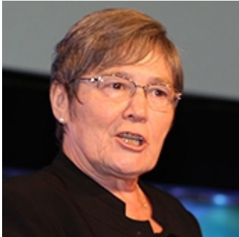
Clare Short Chair of the Management Board of Cities Alliance