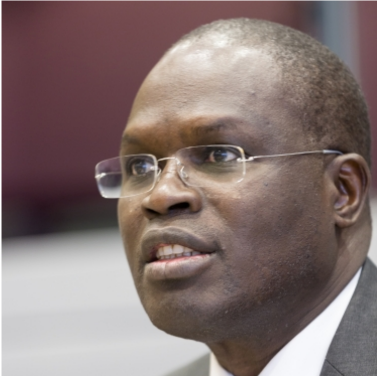
Khalifa Sall Mayor of Dakar, President of UCLG Africa