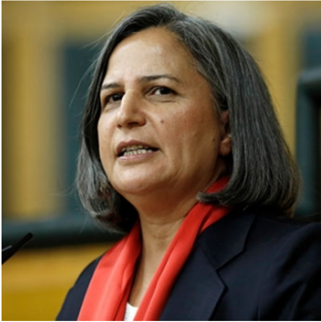
Gülten Kışanak Mayor of Diyarbakır