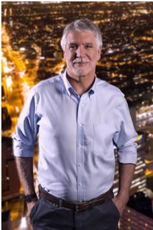
ENRIQUE PEÑALOSA LONDOÑO