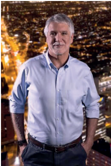
ENRIQUE PEÑALOSA LONDOÑO